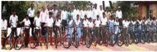
पौर्वीय संवेदीय वस्तु विद्यापीठ येथील सायकल वापर करणारे विद्यार्थी.