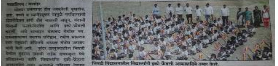
विद्यार्थी विद्यालयातील विद्यार्थ्यांनी इको फ्रेंडली आकाशदिवे बनवले. हे आकाशदिवे उपक्रम करण्याचे प्रयत्न दिले. यामाठी प्रतिष्ठानचे सर्व सह्योग्ये प्रसन्न. या उपक्रमाने विद्यार्थ्यांमध्ये शिवायची, स्वच्छता येवना. विद्यार्थ्यांनी तयार केलेले आकाशदिवे रचानाचे भेट देण्यात आले. यासाठी विद्यालयाचे मुख्याधिकाारी व मुखेल सहयोग्ये मुख्याधिकाारी यांच्या मार्फत आभार व्यक्त केले. या योजनेचा उद्देश विद्यार्थ्यांच्या सोयीसाठी आहे.